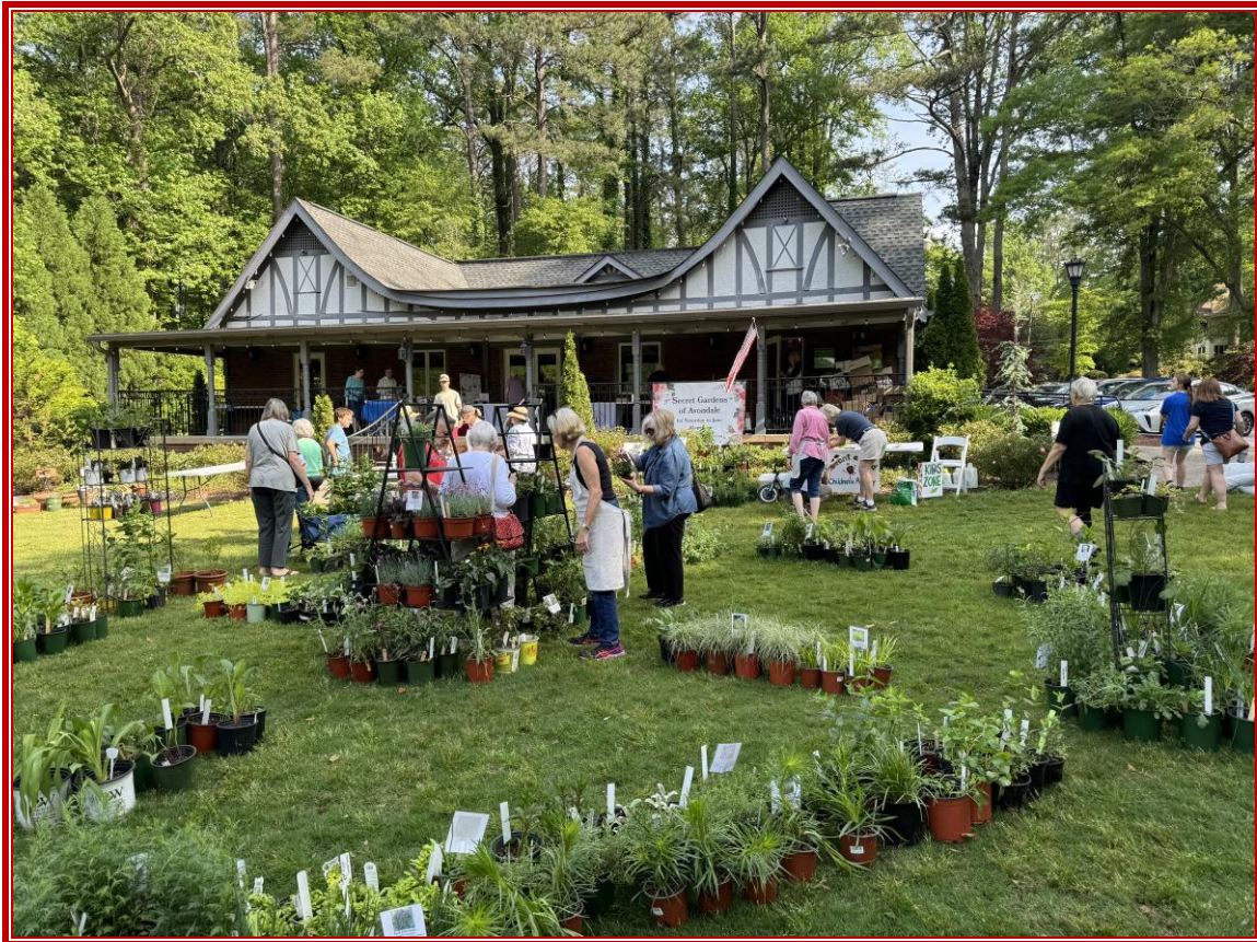
Photo From 2024 Plant Sale at Lake House