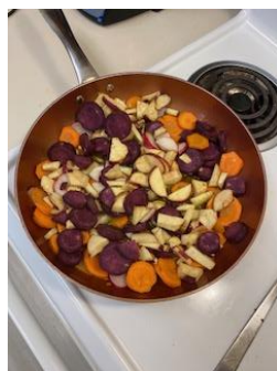
Sliced Veggies to Cook