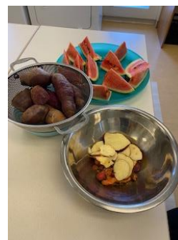
Veggies & Watermelon